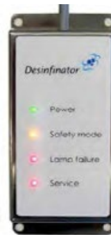
Operator Control - Display panel

Britannia Canopies (except DWE & Mistream Models) are available with Britannia approved Desinfinator UV Modules and Safety components.